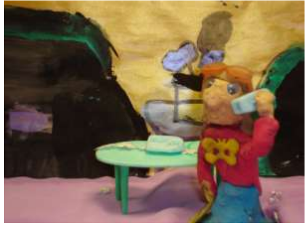
HOLYCROFT SCHOOL ANIMATION

All this and a handful of day events in the community too!