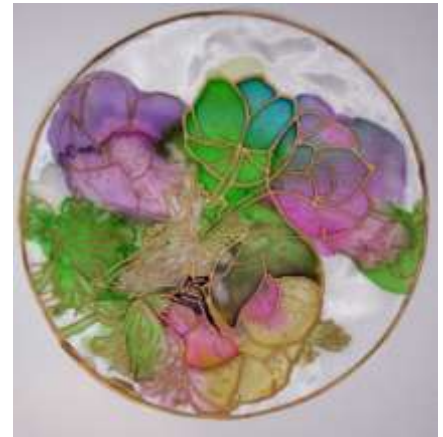
CREATIVE WRITING PROJECT