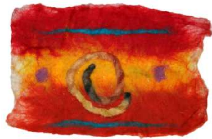
CREATIVE WRITING PROJECT