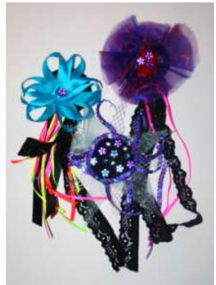
CREATIVE WRITING PROJECT