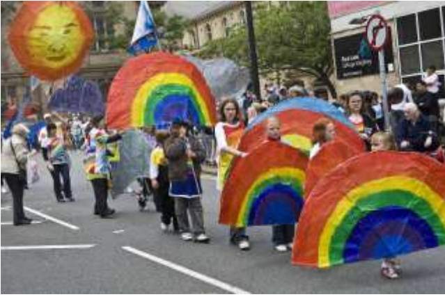
KEIGHLEY GALA PARADE

We entered the gala again this year with an assortment of seasonal weather pieces which gave a colourful splash to the parade.